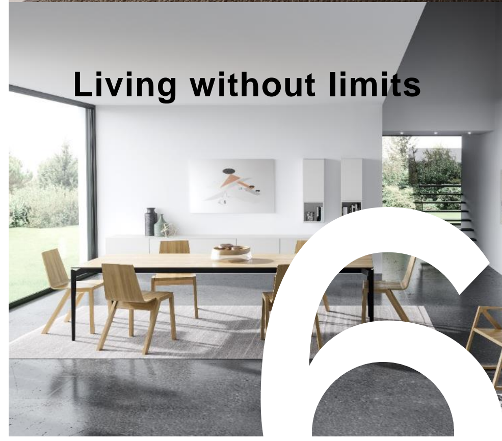
Living without limits