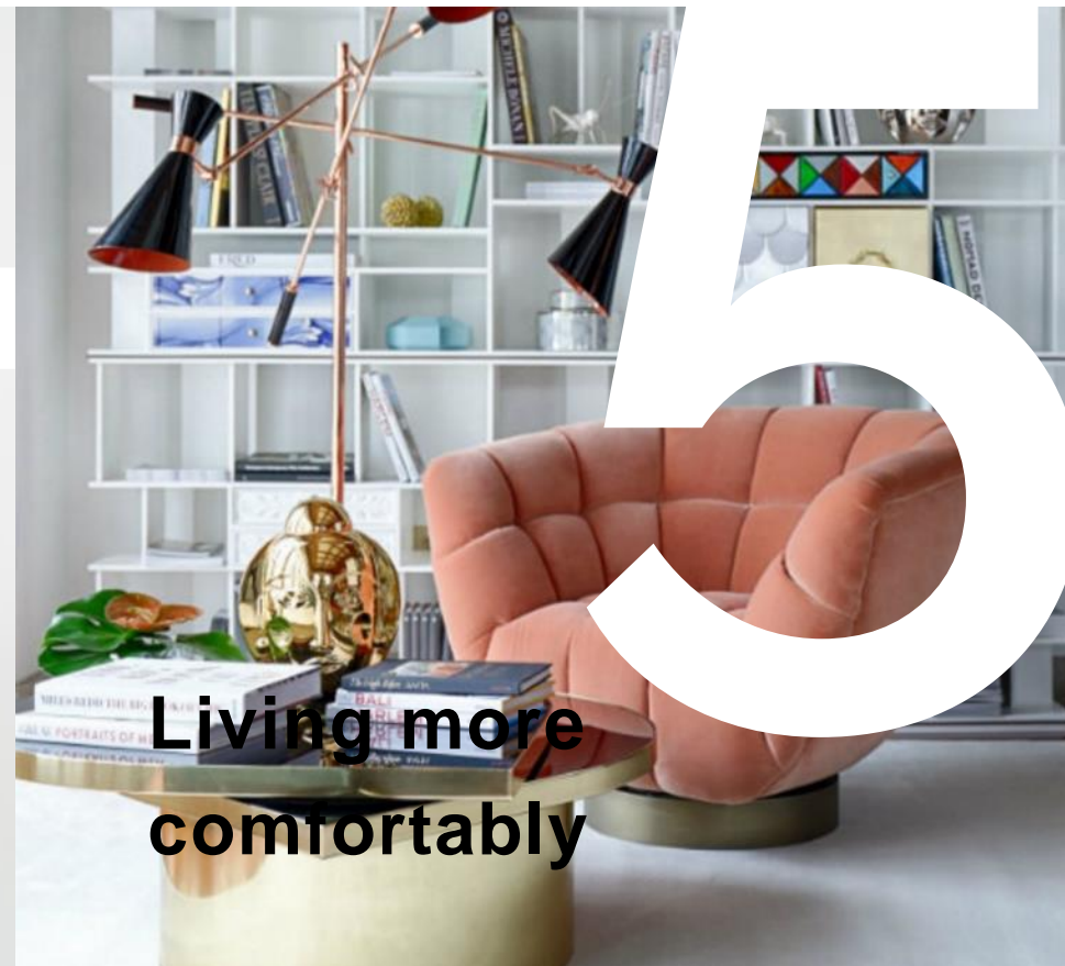
Living more comfortably