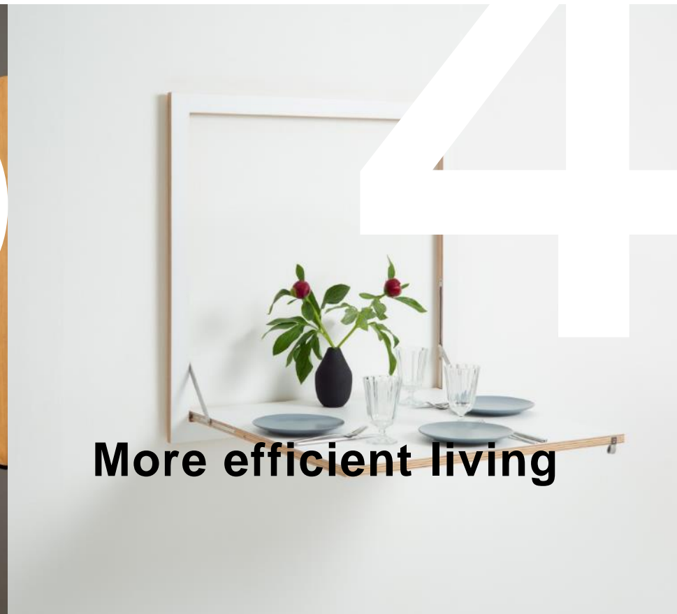
More efficient living