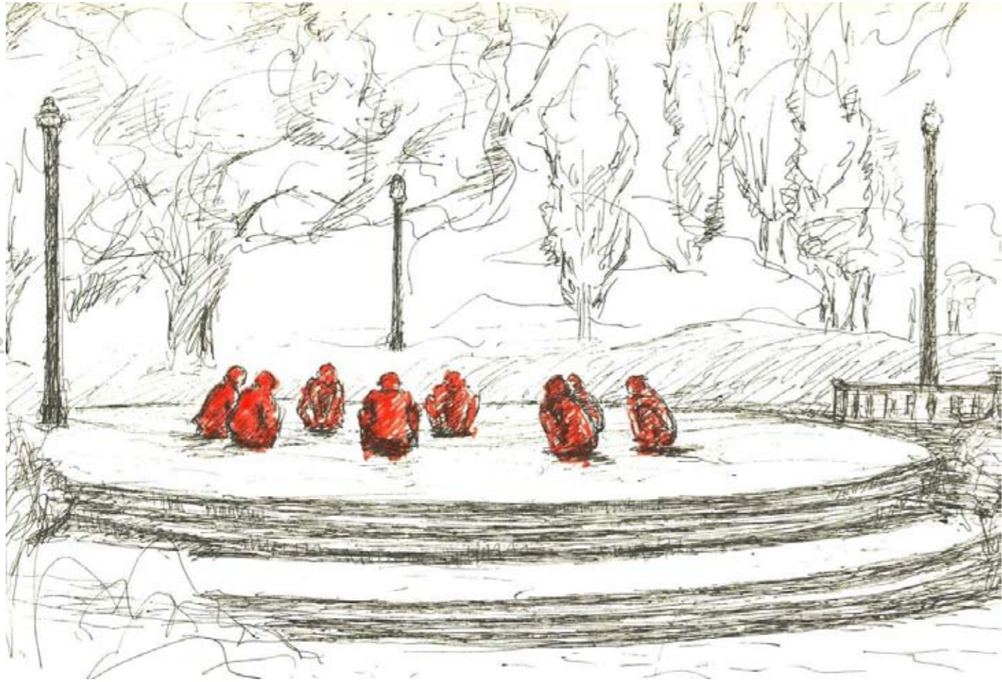
WANG SHUGANG :: Scetch for the Vancouver Biennale 2009