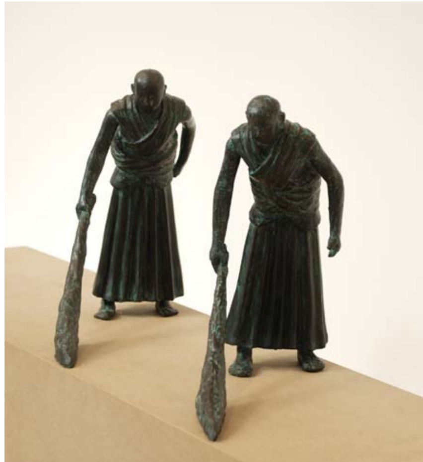
WANG SHUGANG :: Sweeping (Figur A/B), 2004 Bronze, 30 x 12 x 30 cm :: Edition 6/8