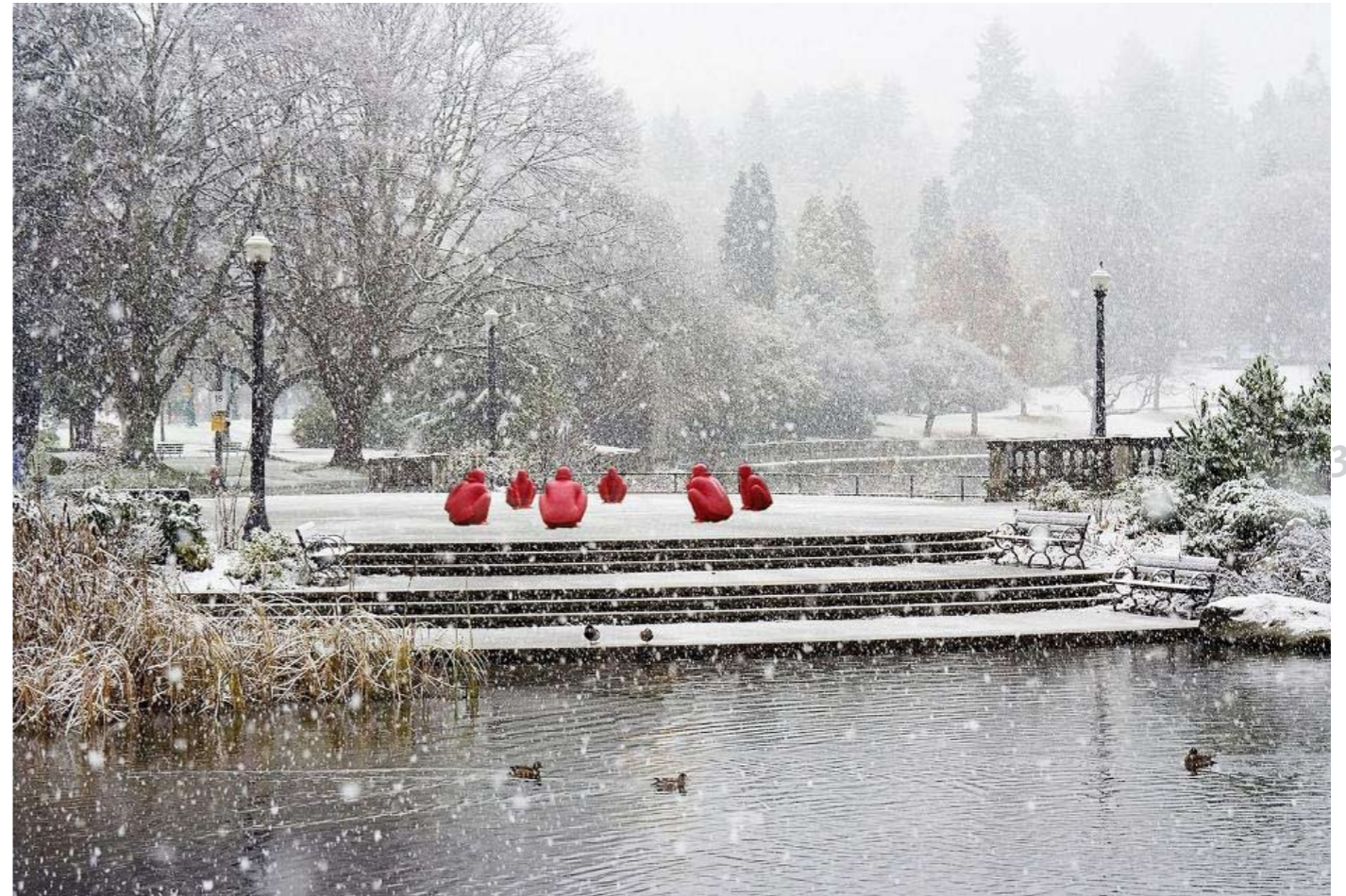
WANG SHUGANG :: Scetch for the Vancouver Biennale 2009