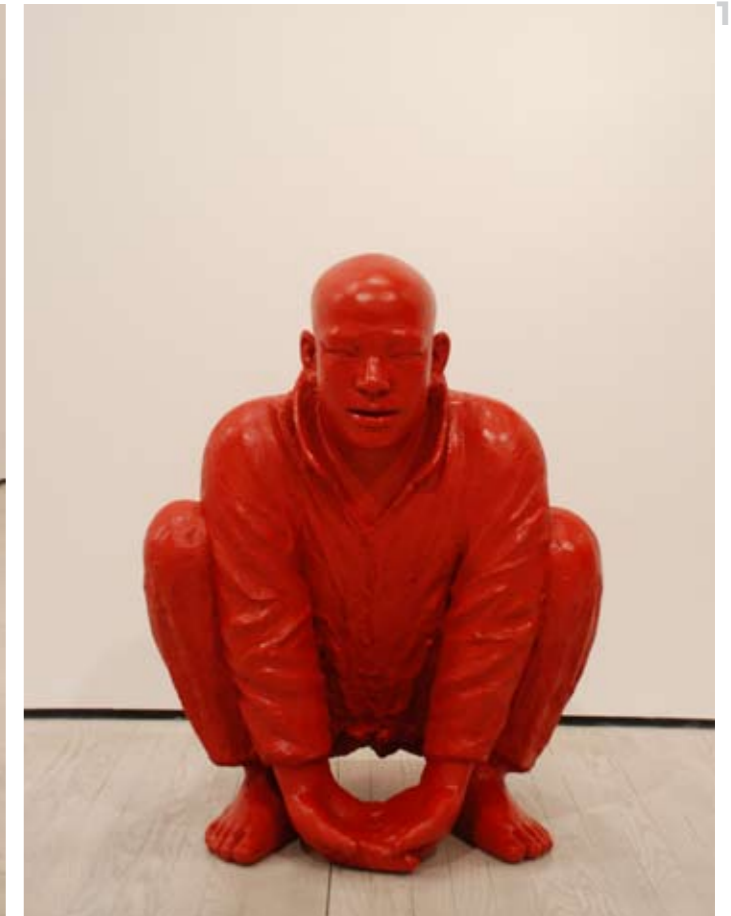
WANG SHUGANG :: Meeting , 2001 Group of 8 sculptures :: Fibreglass, 94 x 70 x 70 cm Edition 1/4 Sculptures have a finish for outdoor placement