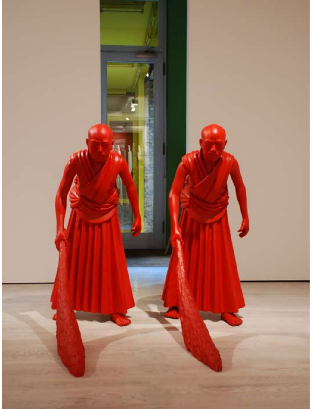
WANG SHUGANG :: Sweeping , 2009 Fibreglass, 150 x 150 x 80 cm Edition in Fibreglas, Ex. 4/8, 5/8