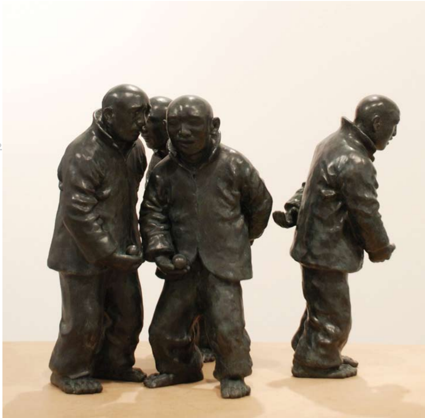
WANG SHUGANG :: Qigong , 2009 Group of 4, each slightly different, sculptures Bronze, 50 x 24 x 26 cm :: Edition 2/8