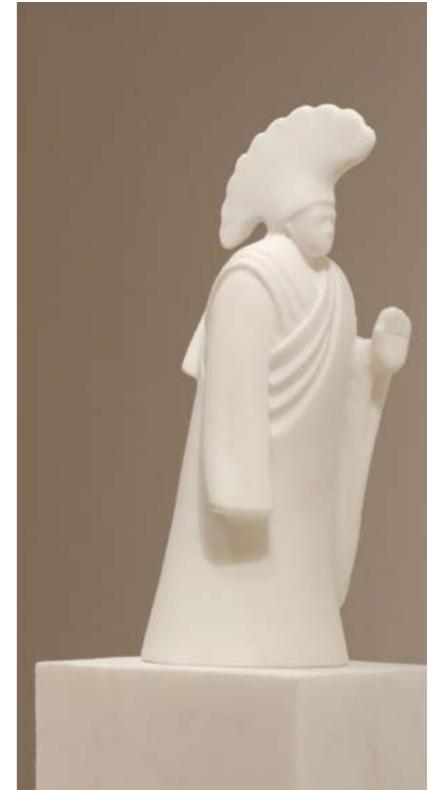
WANG SHUGANG :: Turn to Happiness , 2009 Group of 12 sculptures (Details) :: Marble, 26 x 10 x 10 cm Columns each 190 x 13 x 13 cm :: Edition 1/6