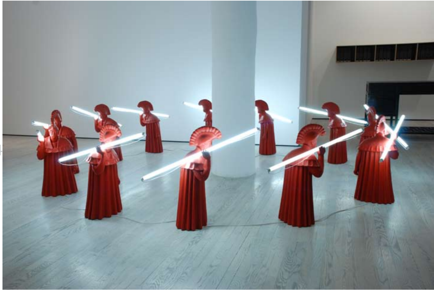
WANG SHUGANG :: Turn to Happiness , 2007 Group of 12 sculptures Fibreglass, modulator tube, 75 x 33 x 30 cm :: Edition 3/4