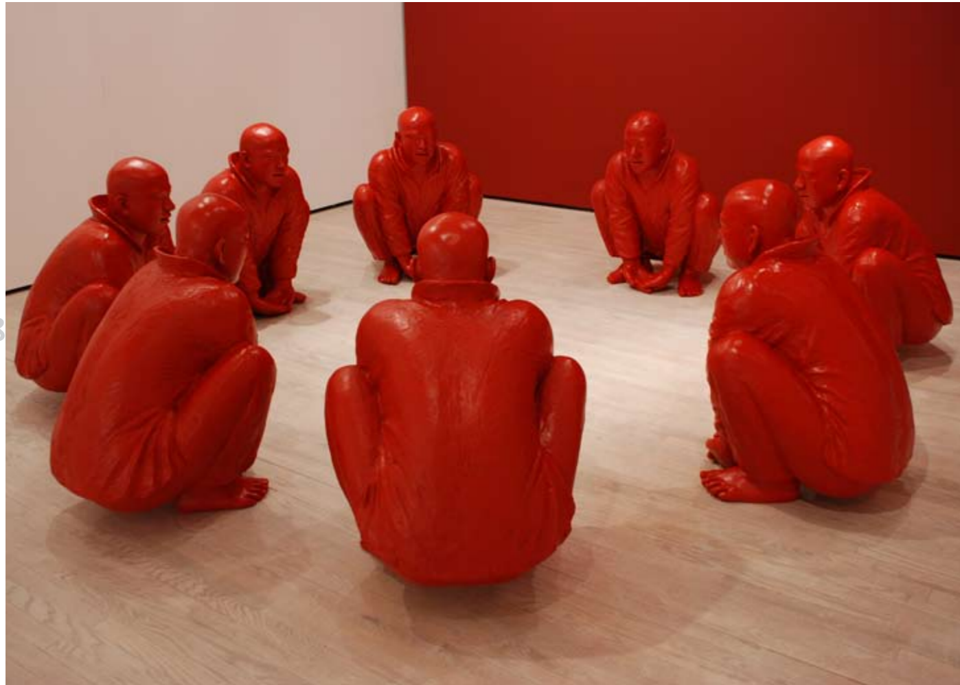
WANG SHUGANG :: Meeting , 2001 Group of 8 sculptures :: Fibreglass, 94 x 70 x 70 cm Edition 1/4 Sculptures have a finish for outdoor placement