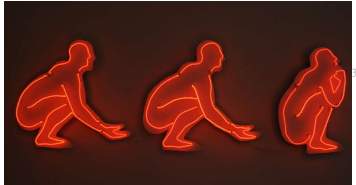
WANG SHUGANG :: Apartment Block Life: Squatters , 2003 Neon, substructure: white paint on wood, 103 x 107 x 15 cm Edition 2/7