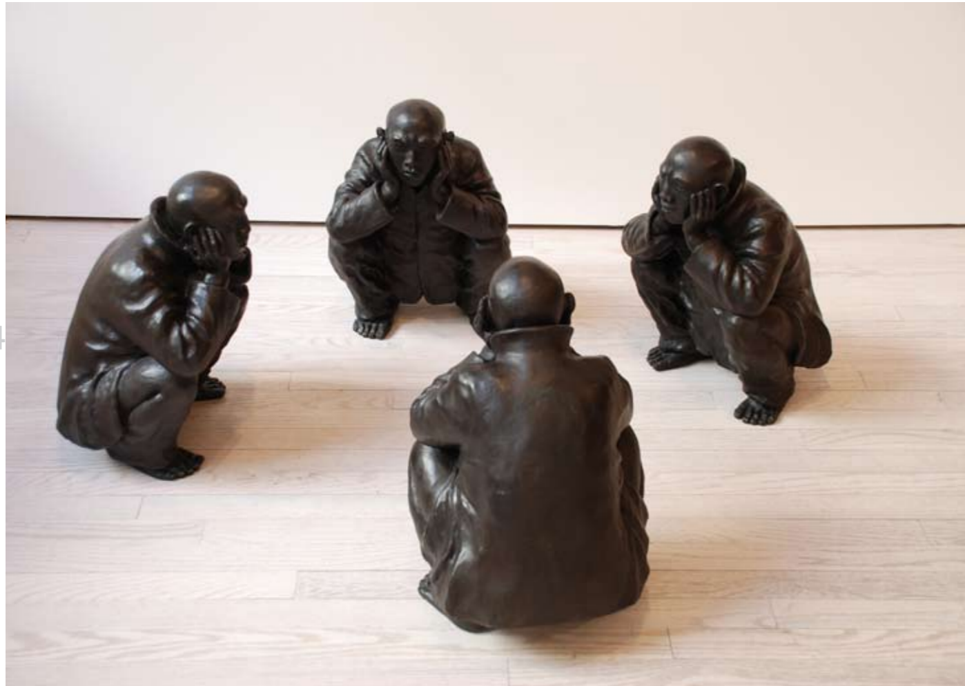
WANG SHUGANG :: Meeting, 2008 Group of 4 sculptures Bronze, 50 x 32 x 30 cm :: Edition 7/8