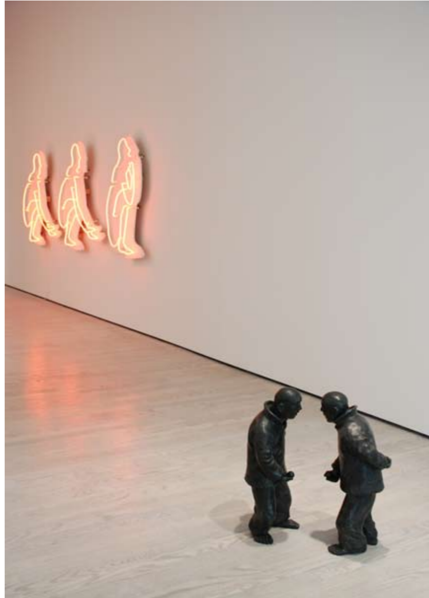
WANG SHUGANG :: Apartment Block Life: Squatters , 2003 Neon, substructure: white paint on wood, 103 x 107 x 15 cm Edition 2/7