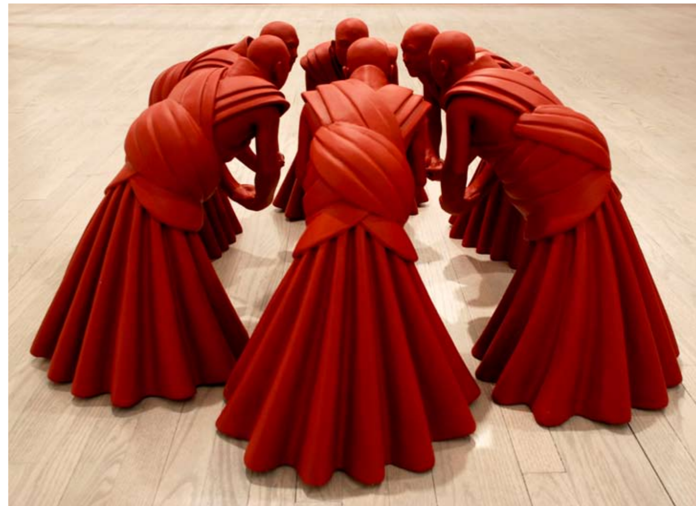
WANG SHUGANG :: Pengtou / Treffen , 2009 Fibreglass, 50 x 40 x 50 cm Edition 1/8 (Edition 4 in Fibreglass, 4 in Bronze)