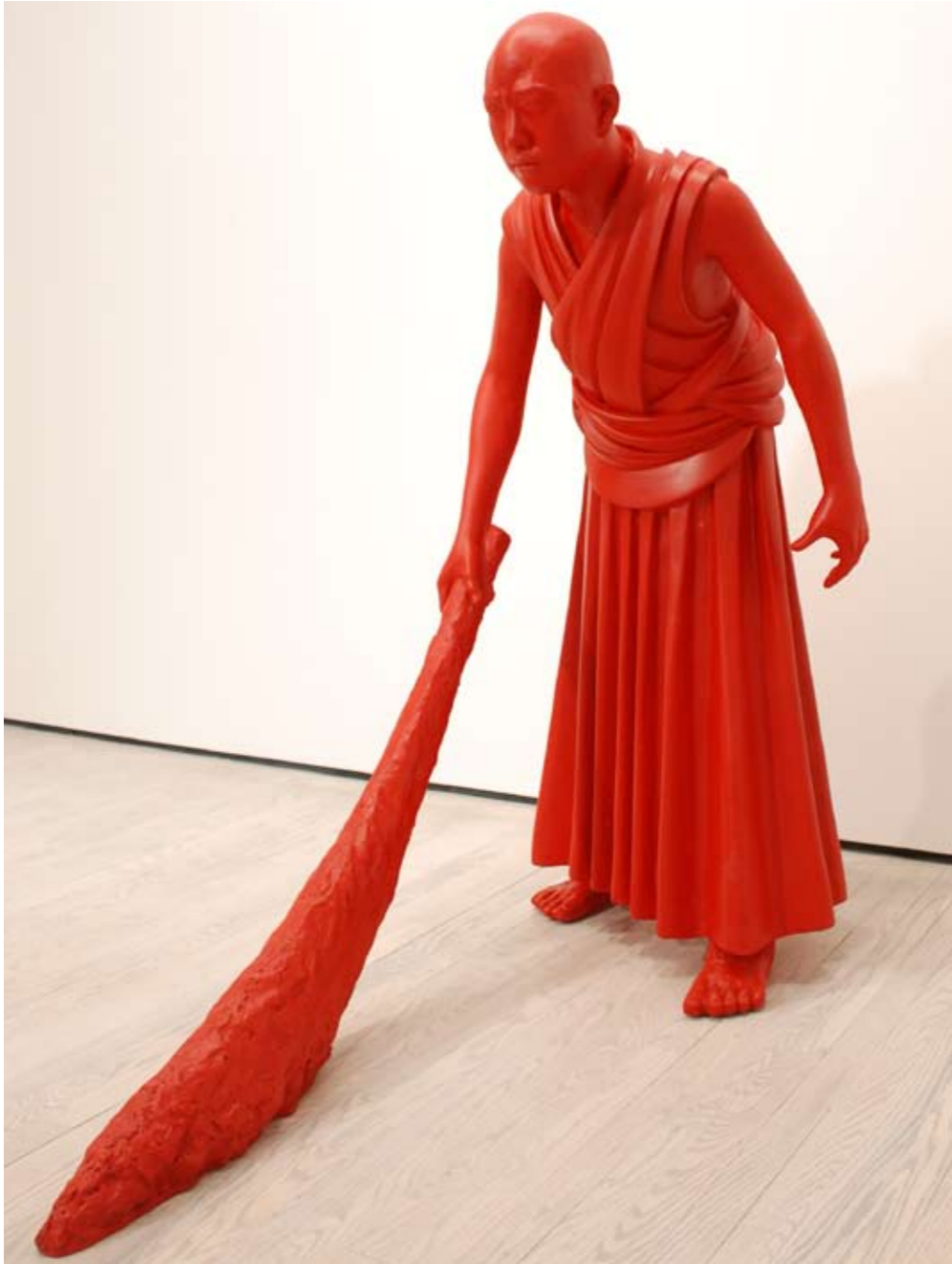
WANG SHUGANG :: Sweeping , 2009 Fibreglass, 150 x 150 x 80 cm Edition in Fibreglas, Ex. 8