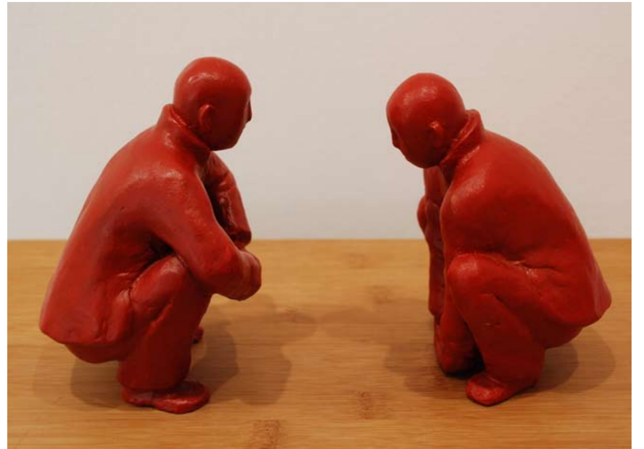
WANG SHUGANG :: Sitzung , 2007 – 2008 Pair :: Bronze, 14 x 10 x 10 cm :: Edition 30