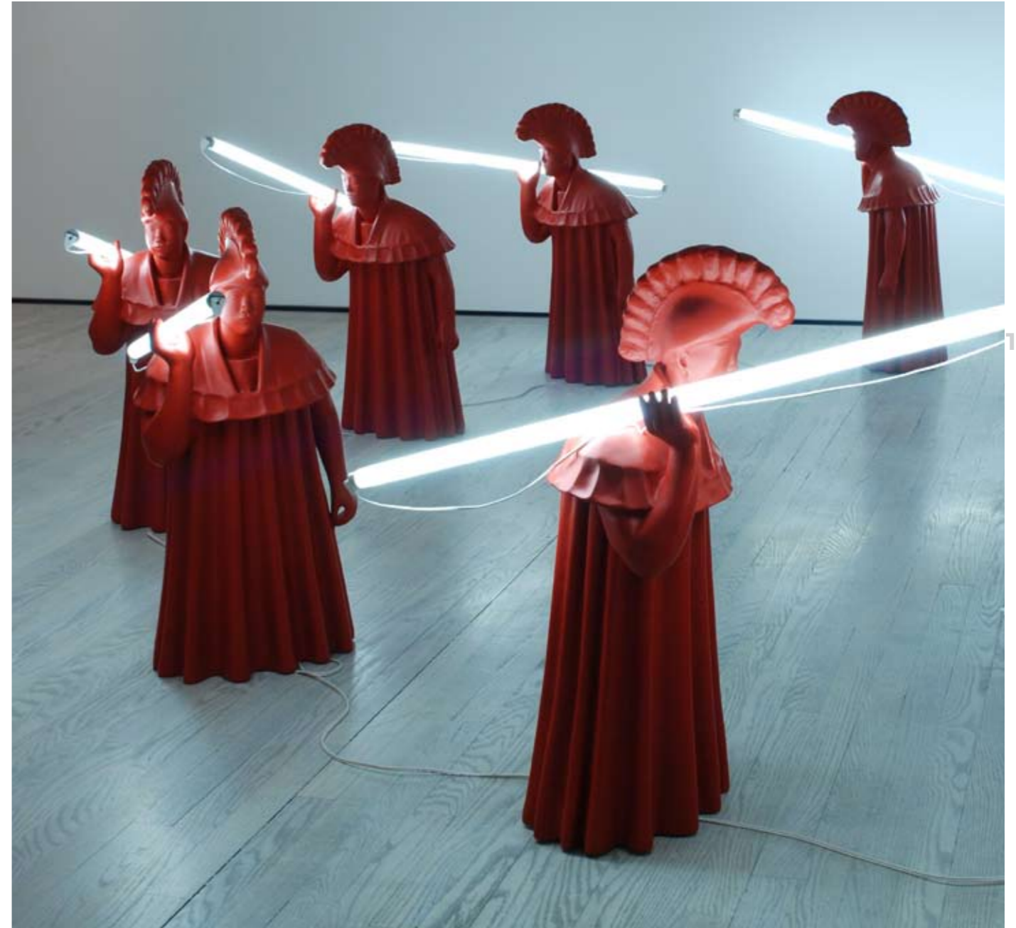
WANG SHUGANG :: Turn to Happiness , 2007 Group of 12 sculptures Fibreglass, modulator tube, 75 x 33 x 30 cm :: Edition 3/4