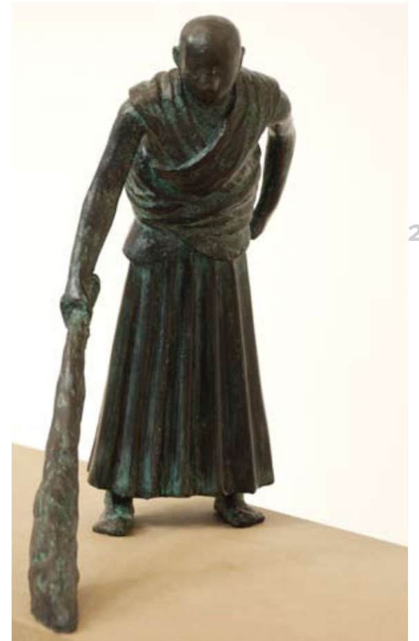
WANG SHUGANG :: Sweeping (Figur A/B), 2004 Bronze, 30 x 12 x 30 cm :: Edition 6/8