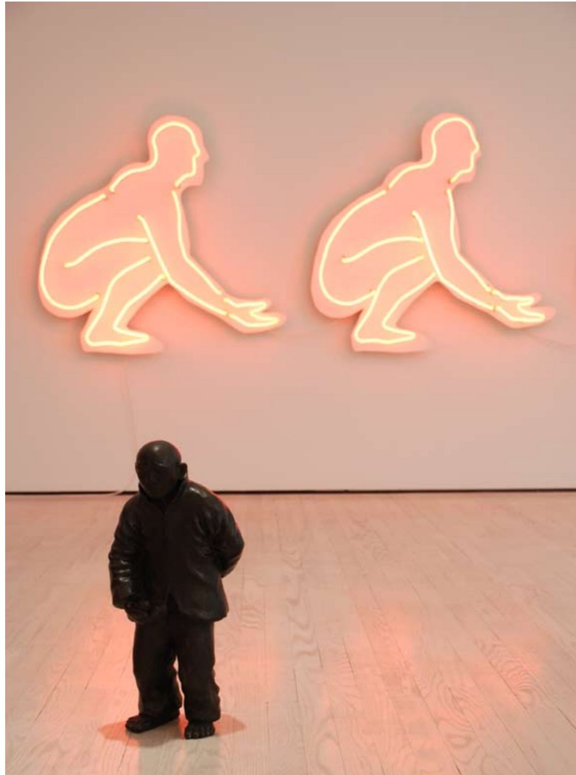
WANG SHUGANG :: CIRCLES , 2009 Exhibition view ALLEXANDER OCHS GALLERIES BERLIN | BEIJING