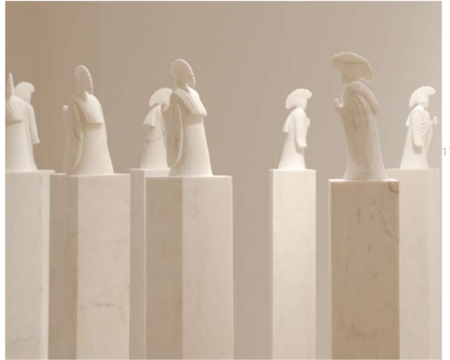
WANG SHUGANG :: Turn to Happiness , 2009 Group of 12 sculptures :: Marble, 26 x 10 x 10 cm Columns each 190 x 13 x 13 cm :: Edition 1/6