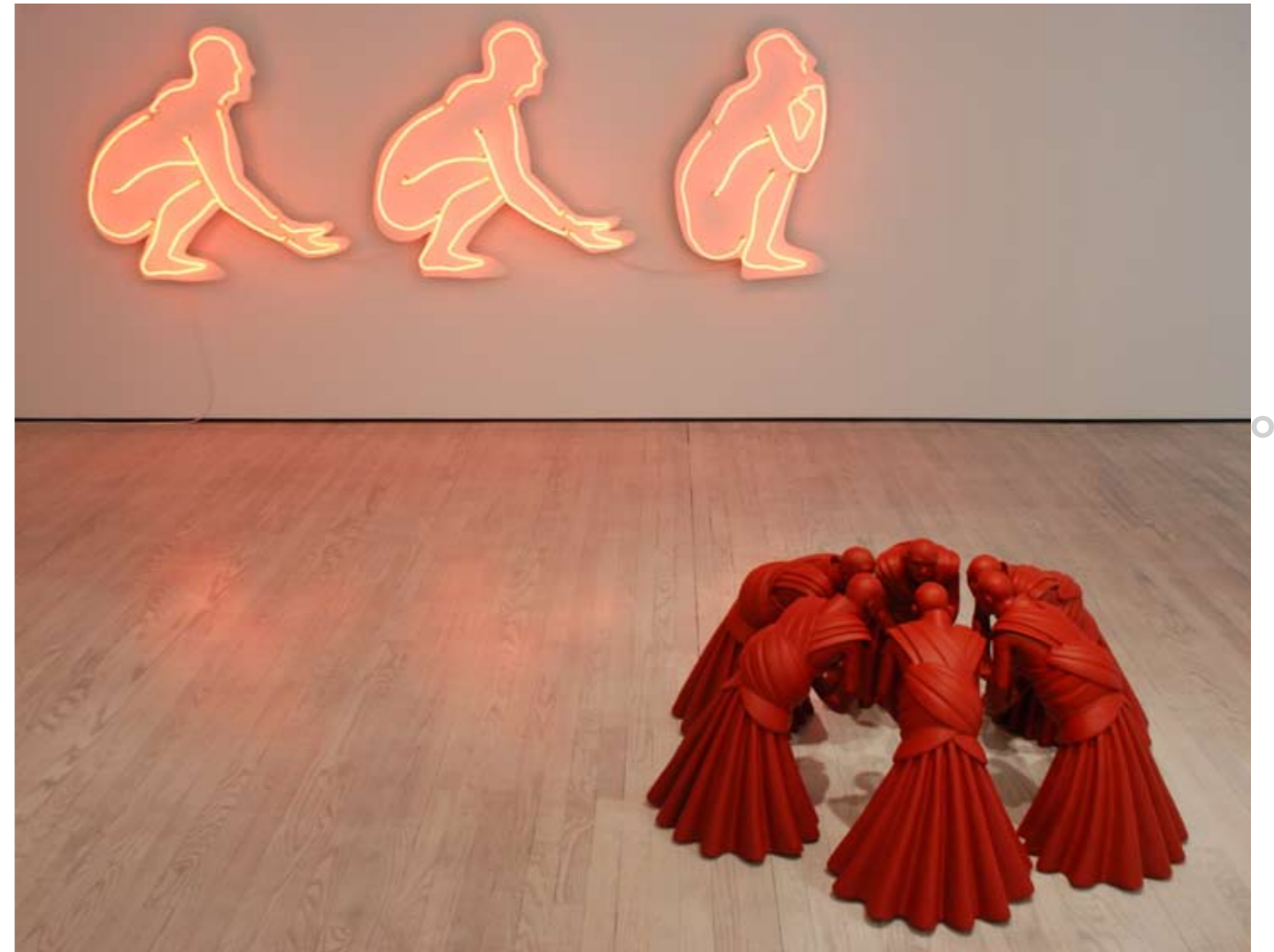
WANG SHUGANG :: CIRCLES , 2009 Exhibition view ALLEXANDER OCHS GALLERIES BERLIN | BEIJING