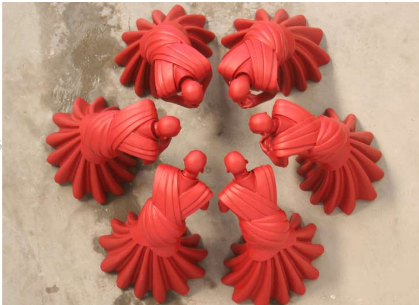
WANG SHUGANG :: Pengtou / Treffen , 2009 Fibreglass, 50 x 40 x 50 cm Edition 1/8 (Edition 4 in Fibreglass, 4 in Bronze)