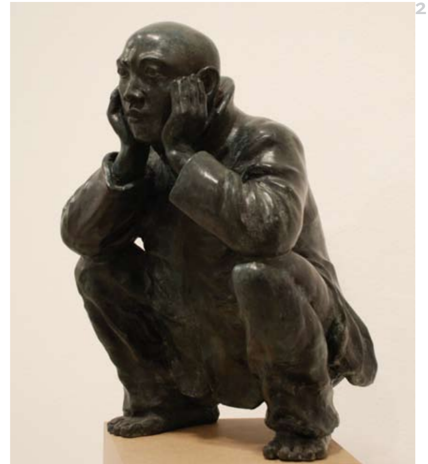
WANG SHUGANG :: Meeting, 2008 Group of 4 sculptures Bronze, 50 x 32 x 30 cm :: Edition 7/8