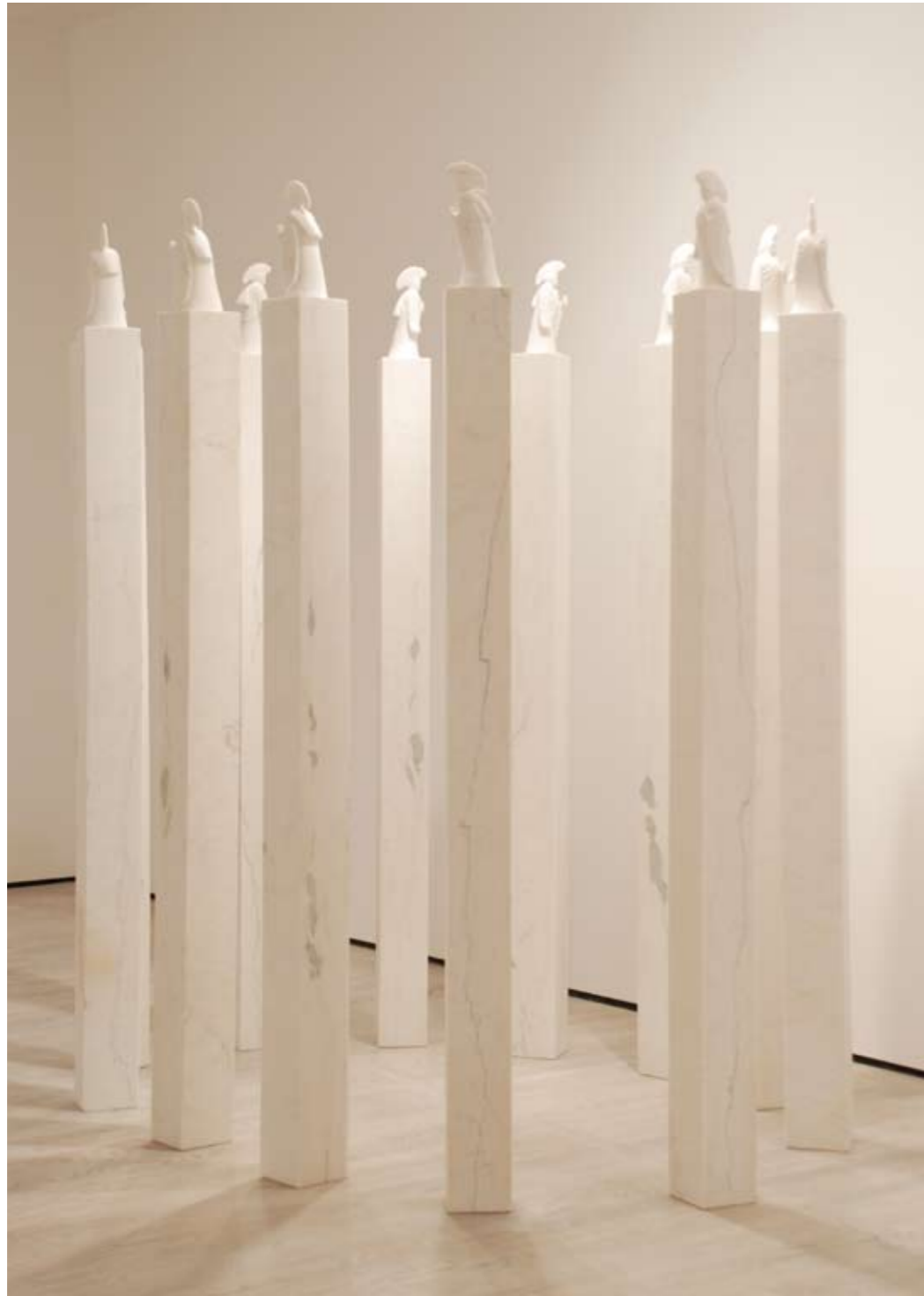
WANG SHUGANG :: Turn to Happiness , 2009 Group of 12 sculptures :: Marble, 26 x 10 x 10 cm Columns each 190 x 13 x 13 cm :: Edition 1/6