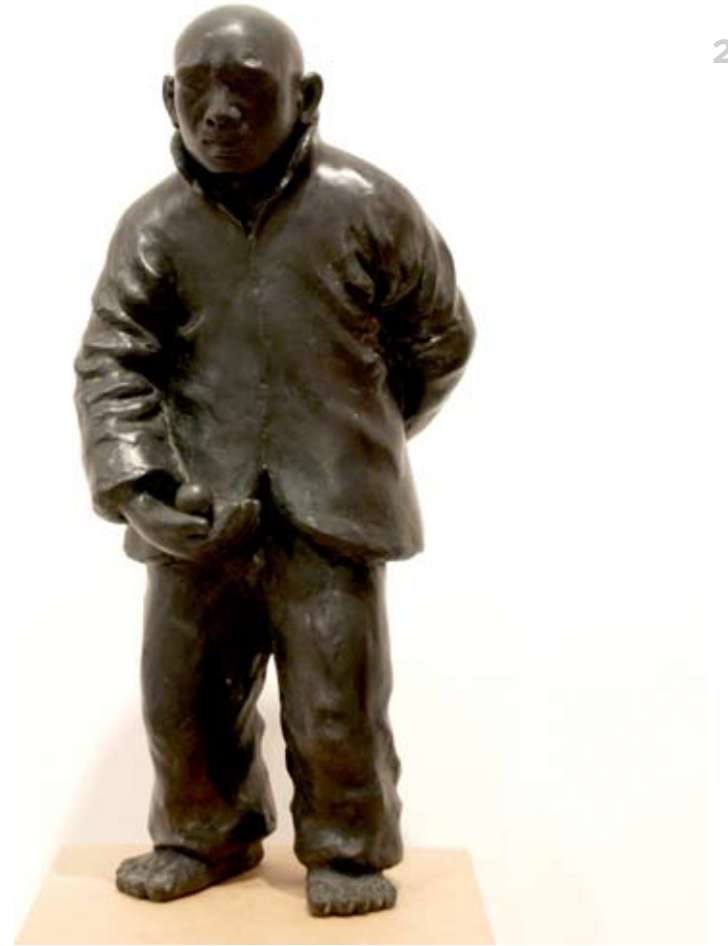
WANG SHUGANG :: Qigong , 2009 Single piece :: Bronze, 50 x 24 x 26 cm Each Edition 8 (each) (four versions, each slightly different)