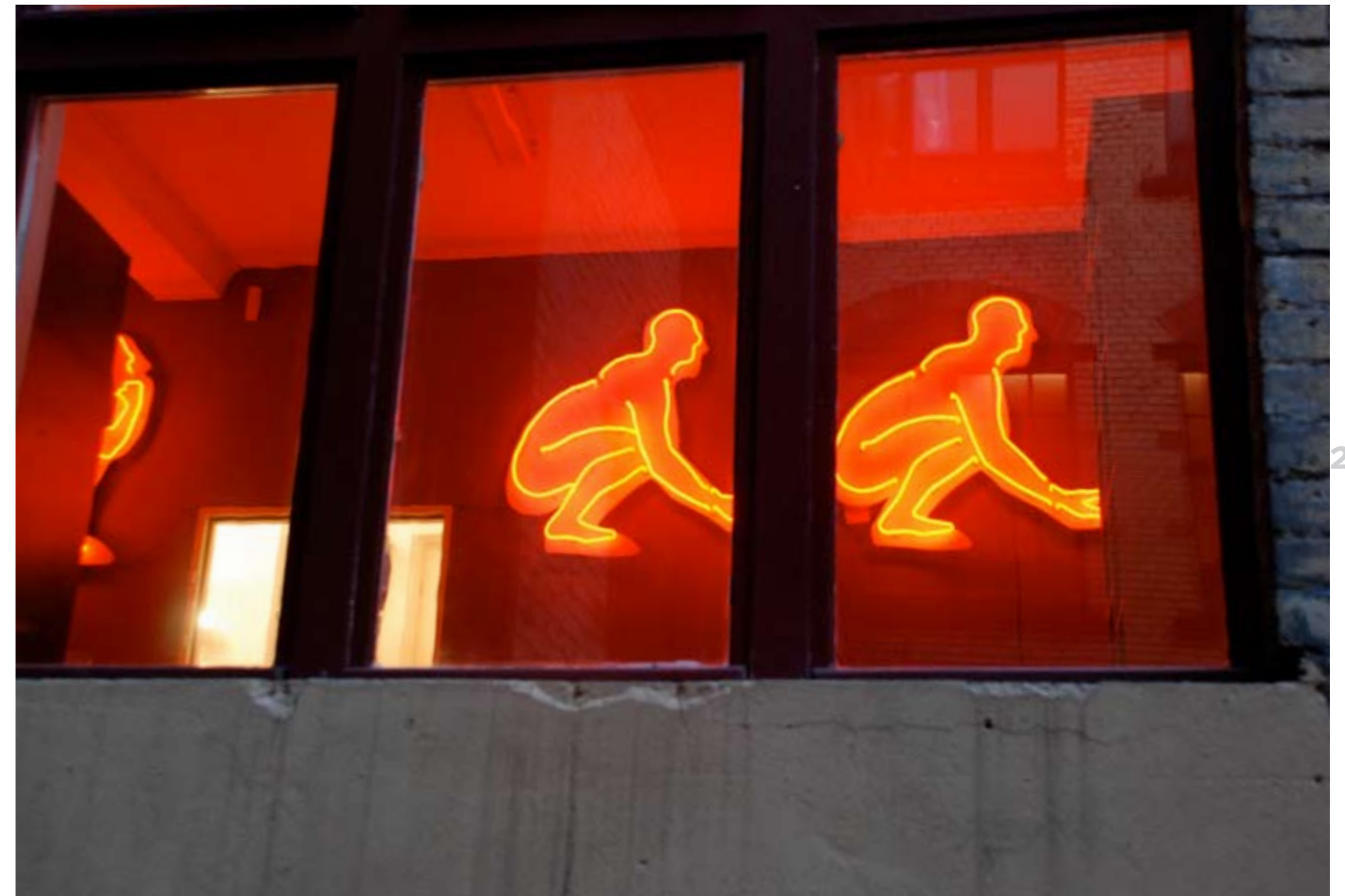
WANG SHUGANG :: Apartment Block Life: Squatters, 2003 Neon, substructure: white paint on wood, 103 x 107 x 15 cm Edition 2/7