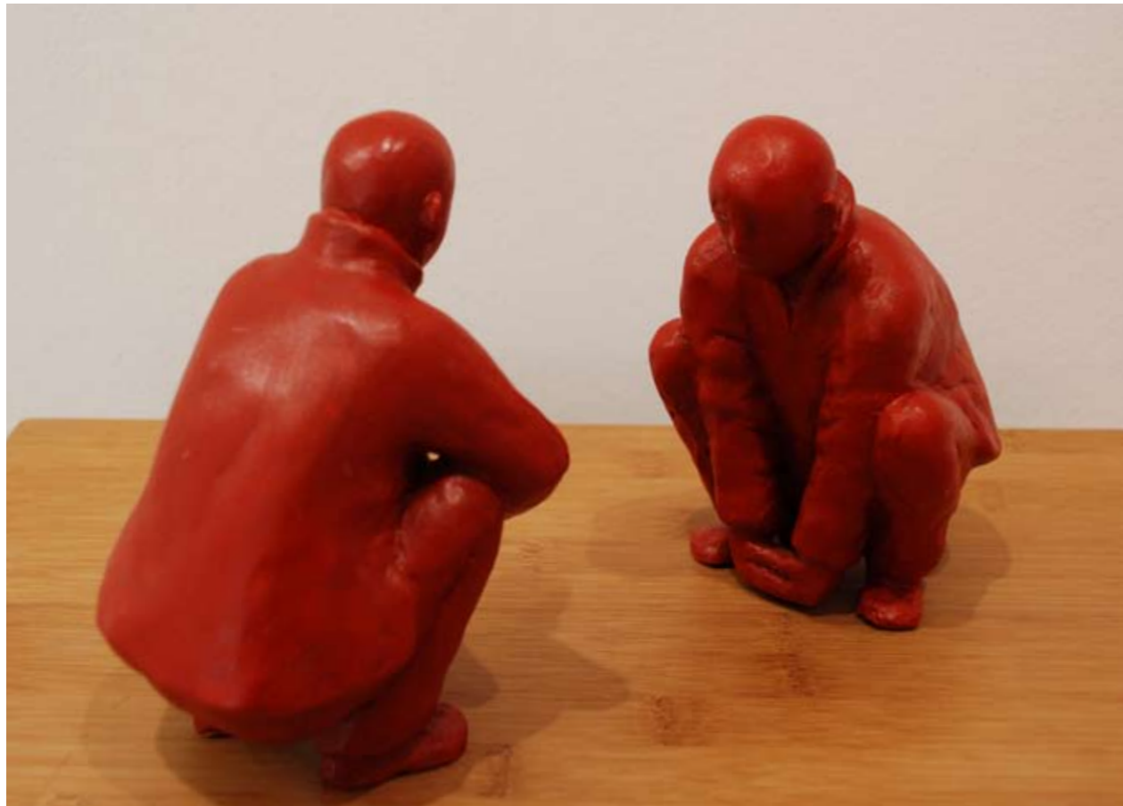
WANG SHUGANG :: Sitzung , 2007 – 2008 Pair :: Bronze, 14 x 10 x 10 cm :: Edition 30